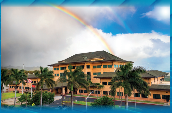
JIATF West - Camp H.M. Smith, Hawaii